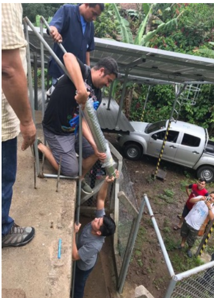
The pump and water flow at the top of the hill !!!!